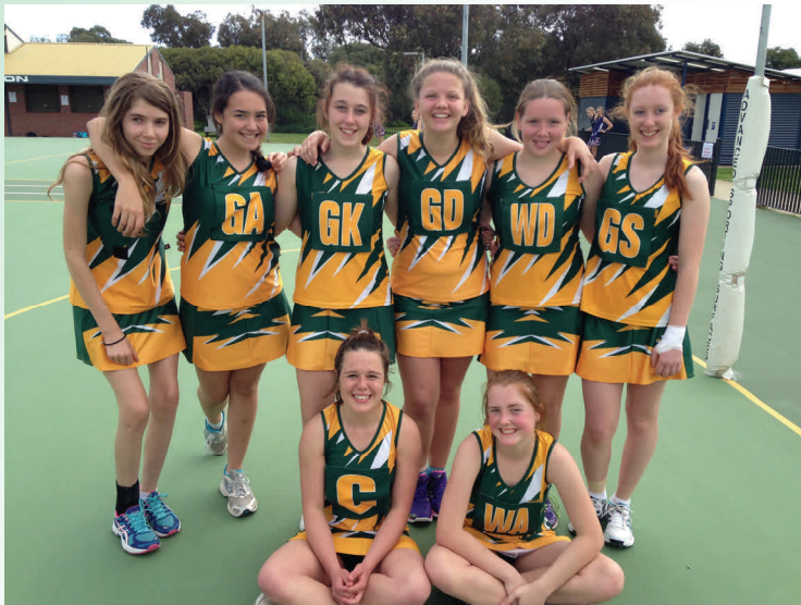
Girls Netball Teams