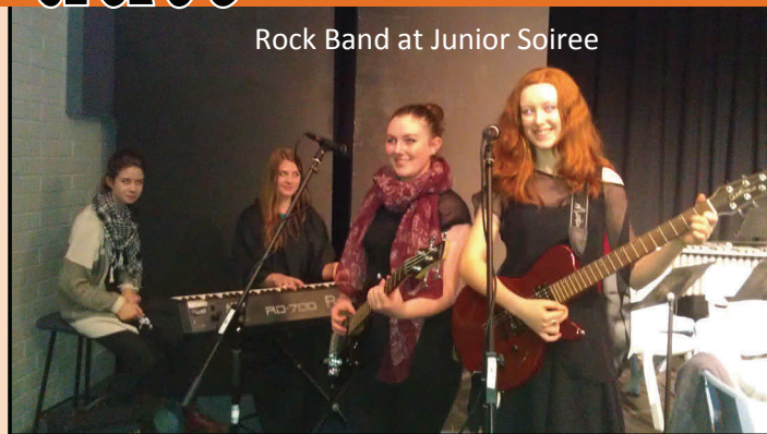
Rock Band at Junior Soiree