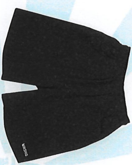
Shorts - Microfibre