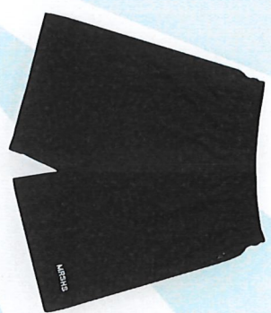
PE Shorts - Fitted / Unisex