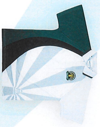
Upper Polo - Fitted / Unisex