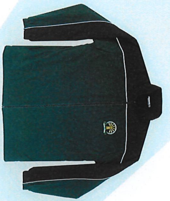
Microfibre Fleece Lined Jacket