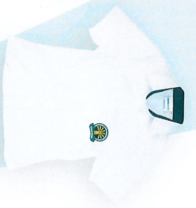
Shirt - Fitted / Unisex