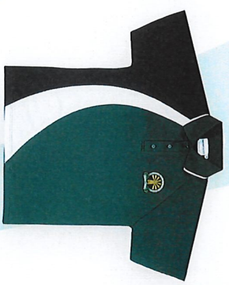
Lower Polo - Fitted / Unisex