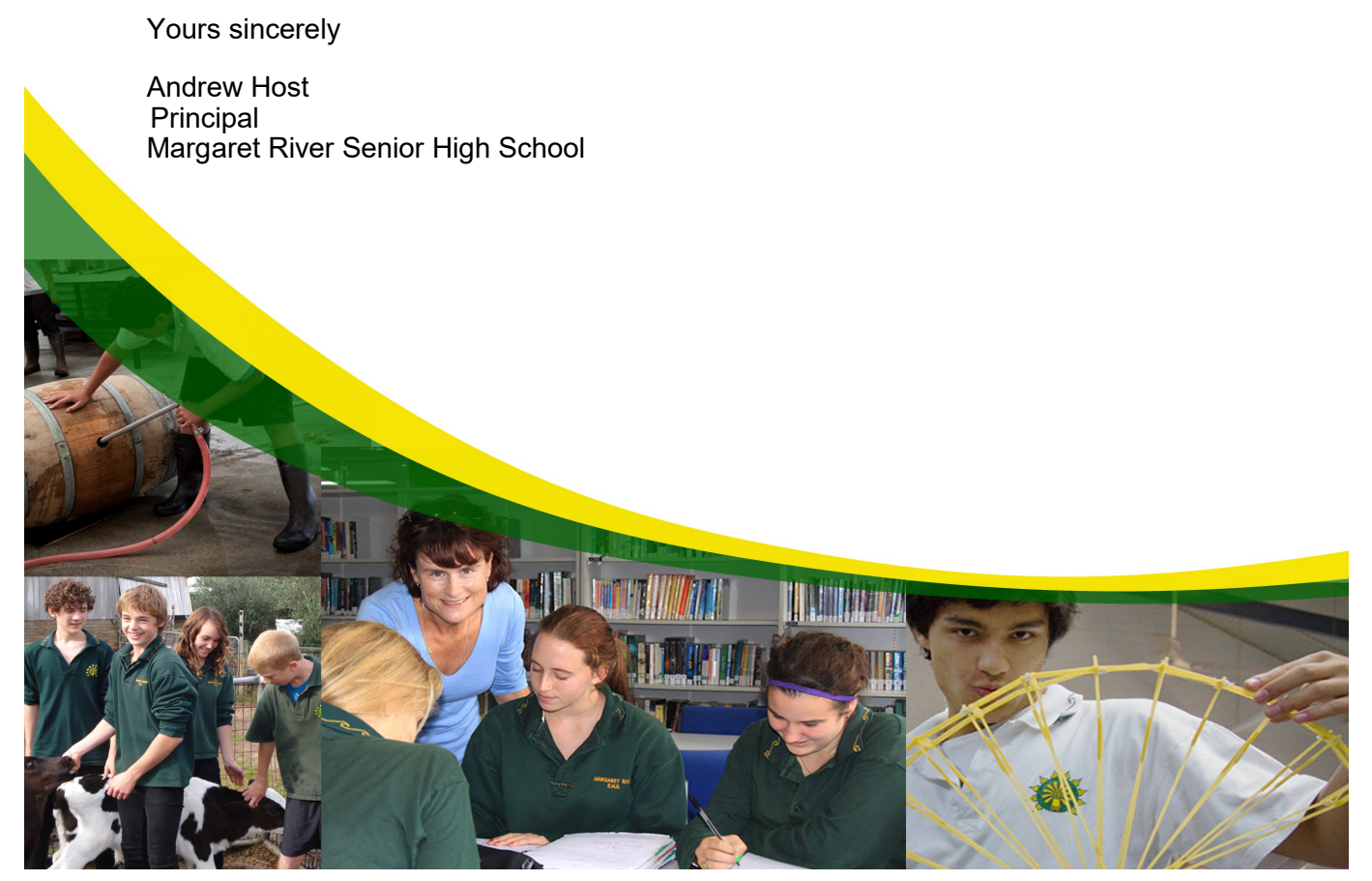
2021 MRSHS Voluntary Contributions and Compulsory Charges

I thank you for your support of our school. Best wishes to you and your family for the festive season and holiday period.