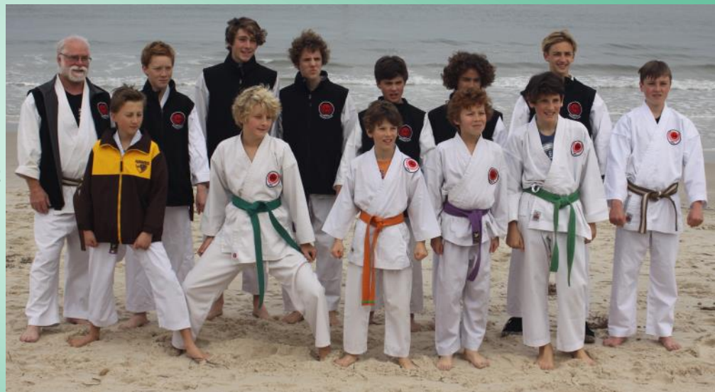
The Margaret River Karate Club contingent who took part in last weekends' 2016 National Karate Championships in Adelaide.

Twelve boys from the Margaret River Karate Club returned home Monday with 30 medals, following a successful three-day tournament in Adelaide. The boys, comprising both junior and senior students took part in the 2016 USKU National Championships, competing in kata, sparring and kumite. The annual event, which is held in different cities – and Japan on alternate years, drew fighters from New Zealand, Japan, Malaysia, Queensland, New South Wales and Western Australia.